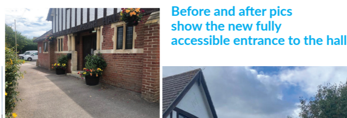
Before and after pics show the new fully accessible entrance to the hall