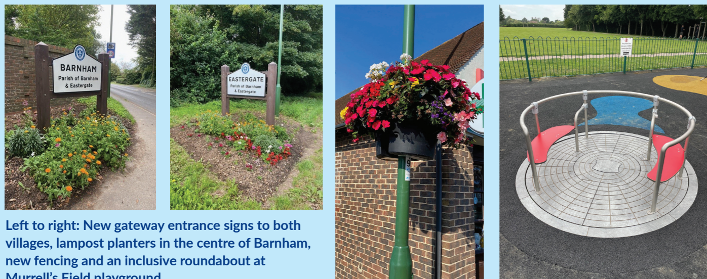
Left to right: New gateway entrance signs to both villages, lamppost planters in the centre of Barnham, new fencing and an inclusive roundabout at Murrell's Field playground.

As a Council we are allowed up to 13 Councillors and therefore we have two vacancies that can be filled through co-option so if you think you could spare a few hours a month to serve and support the community you live in do get in touch with the Clerk to find out more.