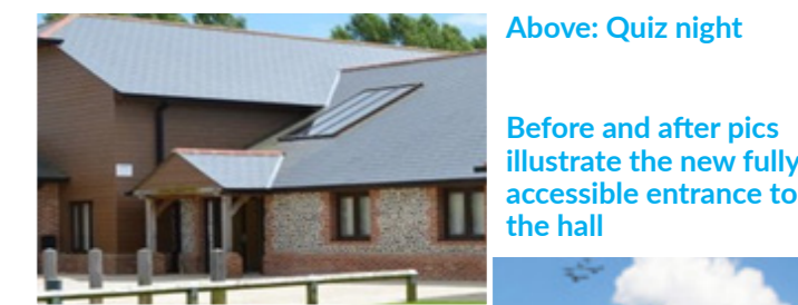
Before and after pics illustrate the new fully accessible entrance to the hall