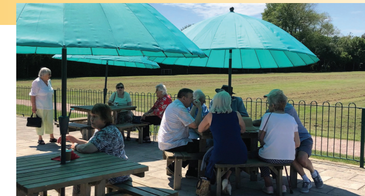
Community coffee morning

A major project has also just commenced to provide a fully accessible entrance to the hall. The entrance will be extended and the current big heavy doors (both external and internal) will be openable with the push of a button. The work is being funded by the Parish Council through a Public Works Loan that has been applied for and approved. The cost to the community will be covered by the additional housing we have had to accept in recent years. The work is due to be completed before the end of the year and whilst it is taking place we will have a temporary entrance and some disruption but we hope to keep this to a minimum.