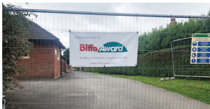
Renovation work has been extensive

After an extensive support project during Covid, the Trust were awarded a 3-year National Lottery Grant of £176,000 to aid with recovery. Now in the final year of the grant, a lot has been happening at both of the community buildings...