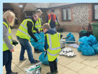
Litter pickers hard at work

Our litter pickers committed over 250 hours of volunteering time and removed an estimated 300+ kg of litter from our streets, hedgerows and public spaces.