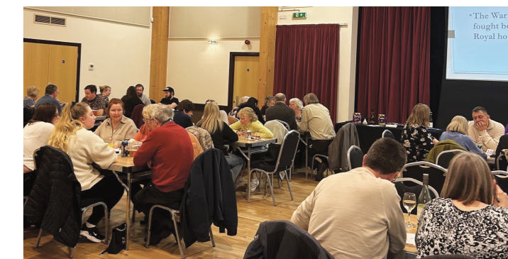
Above: Quiz night