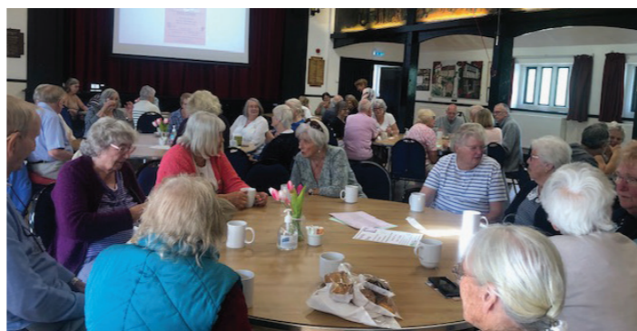
Tuesday coffee morning