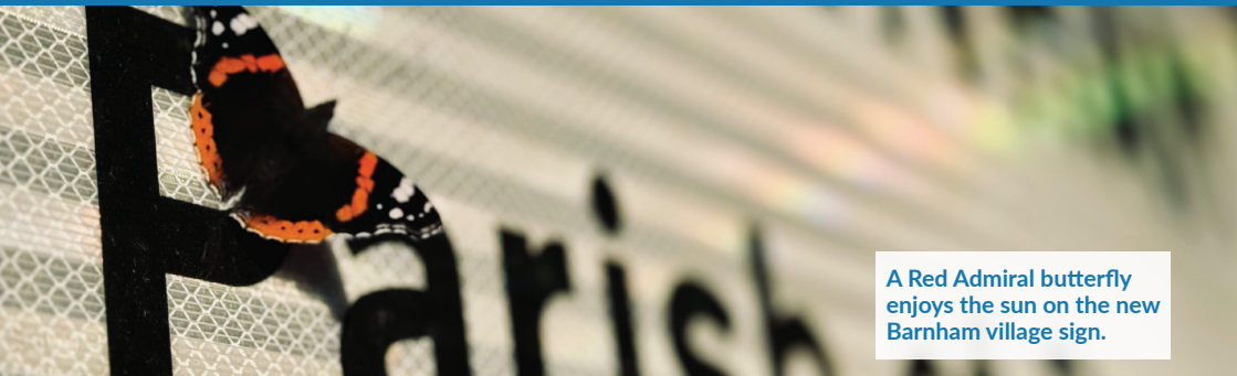
A Red Admiral butterfly enjoys the sun on the new Barnham village sign.