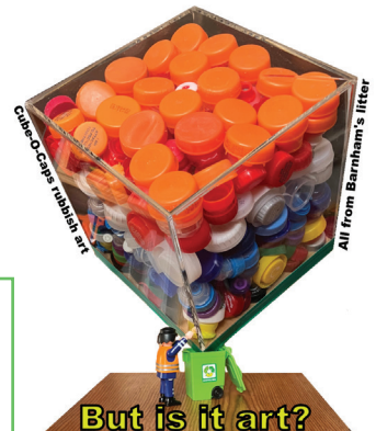
Below: The 'Cube-O-Caps' art installation created from littered plastic tops.