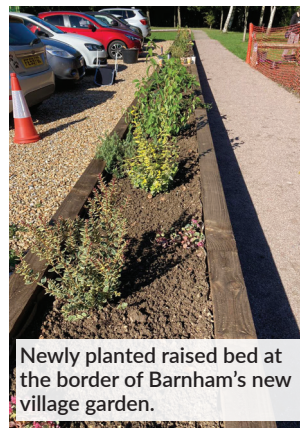
Newly planted raised bed at the border of Barnham's new village garden.

Our Parish's People, Places and Spaces working group was established to help enhance the overall appearance and liveability of Barnham and Eastergate, fostering a sense of community and creating inviting spaces for residents and visitors alike. The group aims to enhance Barnham and Eastergate villages, to create a beautiful, well-maintained, and welcoming environment where individuals can connect, find friendship, and enjoy a sense of belonging.