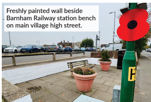
Freshly painted wall beside Barnham Railway station bench on main village high street.

Alongside the raised bed we have planted a wildflower area. The raised bed edge is a suitable height to perch on to admire the area as it grows, and to start conversations. We hope the village garden will be the start of a new social area in the community. In the coming year we will continue to develop the area to create a place of well-being, using a