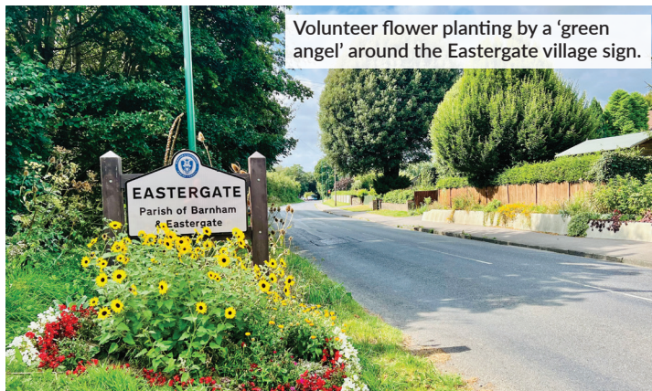
Volunteer flower planting by a 'green angel' around the Eastergate village sign.