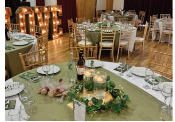
Barnham Hall dressed for a wedding reception.

The Parish Council works in conjunction with the Barnham and Eastergate Community Trust to run the two halls in our locality, with the aim of providing social, recreational, environmental and health benefits to the community. Between them, the two halls host thousands of visitors across hundreds of events each year. In 2024 these included: more than a hundred coffee mornings, more than fifty parties (some for children, some for adults), twenty-four craft workshops, twenty-three book clubs, fifteen quizzes, ten weddings, six line-dance evenings, five afternoon teas, two dog shows, and a murder mystery evening.