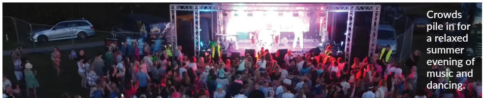
Crowds pile in for a relaxed summer evening of music and dancing.

MAMF - or 'Music at Murrell's Field' - is the biggest community run, family music event in West Sussex. Sponsored and supported by the local businesses and musicians of Barnham and Eastergate and planned by a dedicated team of volunteers. We are excited to reveal that this year's headline act will be a tribute to one of the most prominent London ska and pop bands of the 80's: Madness. Join us from 5pm on Saturday 14th June 2025 and enjoy a relaxed summer evening of music and dancing. Bring your own picnic or treat yourself from one of the many mouth-watering food vendors on site. Alongside 'Complete Madness' are many other fabulous acts - it will be a night to remember!