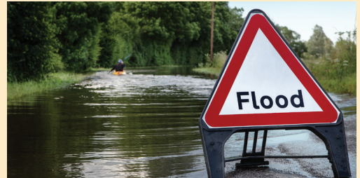
Our Resilience Team provides assistance, guidance and support in the event of emergencies in the area.

Our Resilience Team is not an emergency service or substitute for the proper authorities and utilities; it is there only for when there is no other help available. In the past we have provided assistance for flooded residents, and we regularly provide First Aid courses and emergency training to our local volunteers. We are at present building up our equipment for emergency use: generators and lighting, heaters and blankets, sandbags, radios, tools and torches. Contact nina@eastergatehall.org.uk for more information.