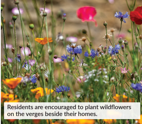
Residents are encouraged to plant wildflowers on the verges beside their homes.