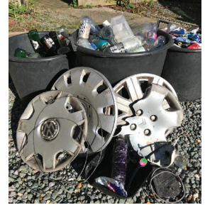
A selection of the items collected by our litter-picking volunteers.

Thank you to the volunteers who have helped keep our villages free of litter. 2025 will feature littery specials, technical firsts and artistic silliness, and further efforts to broadcast our anti-littering message.