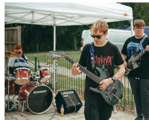
Above: Students from Ormiston Academy perform as Hybrid at the May Fair in Murrell's Field

Our coffee mornings continue to bring neighbours together for conversation, cake and community news, with volunteers keeping the kettles warm. In August, the halls hosted a Family Fun Day that welcomed more than 150 people for music, magic and excellent food from Fries Love—an afternoon made possible in part by support from Barratt Homes.