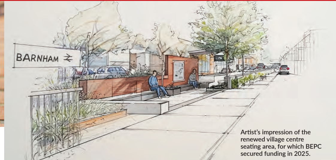
Artist's impression of the renewed village centre seating area, for which BEPC secured funding in 2025.

FOR MORE INFORMATION EMAIL: VOLUNTEER@BARNHAMANDEASTERGATE-PC.GOV.UK