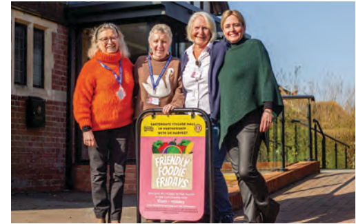
Above: Our volunteers make the work in the parish possible.

Your Parish Council is proud to support this spirit. Over recent years, we've established dedicated working groups to care for our green spaces, review planning applications, champion our natural environment, prepare for emergencies, and keep residents informed through our newsletters. Every parish councillor is a volunteer too, and we are deeply grateful for the time and goodwill that so many of you offer so freely. After decades of sustained lobbying, I am pleased to say that developer contributions are now beginning to flow into the parish at meaningful scale.